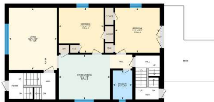
1st Floor Exterior Area 873.61 sq ft Interior Area 736.57 sq ft Excluded Area 144.82 sq ft