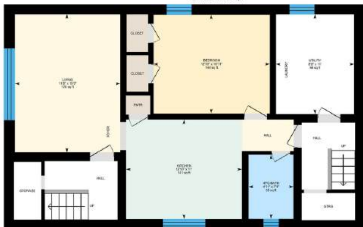
Basement Unit (Below Grade) Exterior Area 748.55 sq ft Interior Area 612.90 sq ft Excluded Area 239.85 sq ft