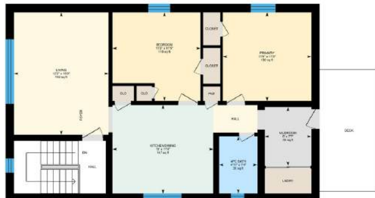
2nd Floor Exterior Area 648.77 sq ft Interior Area 811.05 sq ft Excluded Area 80.66 sq ft