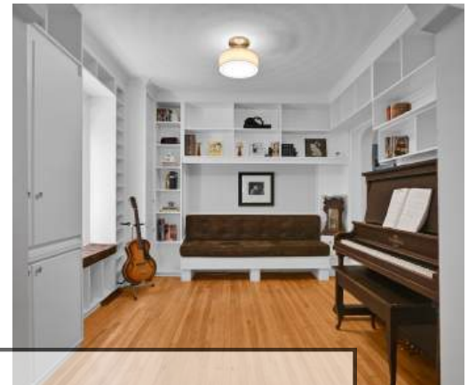
280 FLORA STREET OTTAWA CENTRE