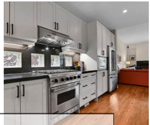
481 MELBOURNE AVENUE VILLAGE OF WESTBORO